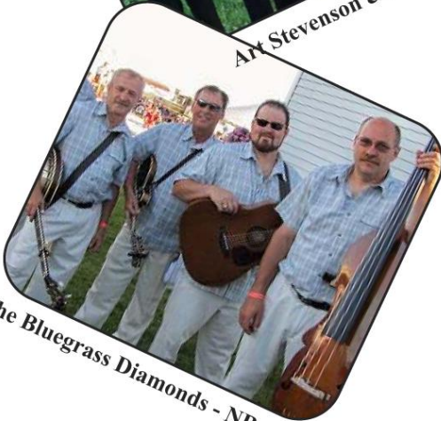
The Bluegrass Diamonds - NB

We reserve the right to change the program without prior notice.